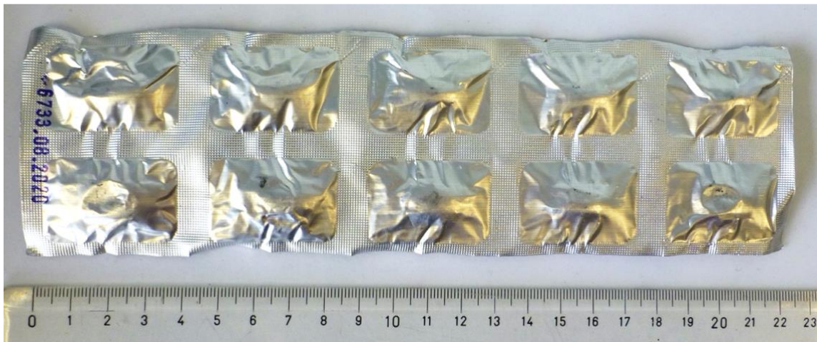
Supplemental Figure S3: Additional photo of “Amoxicillin 500 mg + Clavulanic acid 125 mg BP” tablets identified as falsified by authenticity inquiries.

Blister pack with a length of 220 mm, not matching the length of the blister pack of the genuine product which was 195 mm according to the stated distributor.