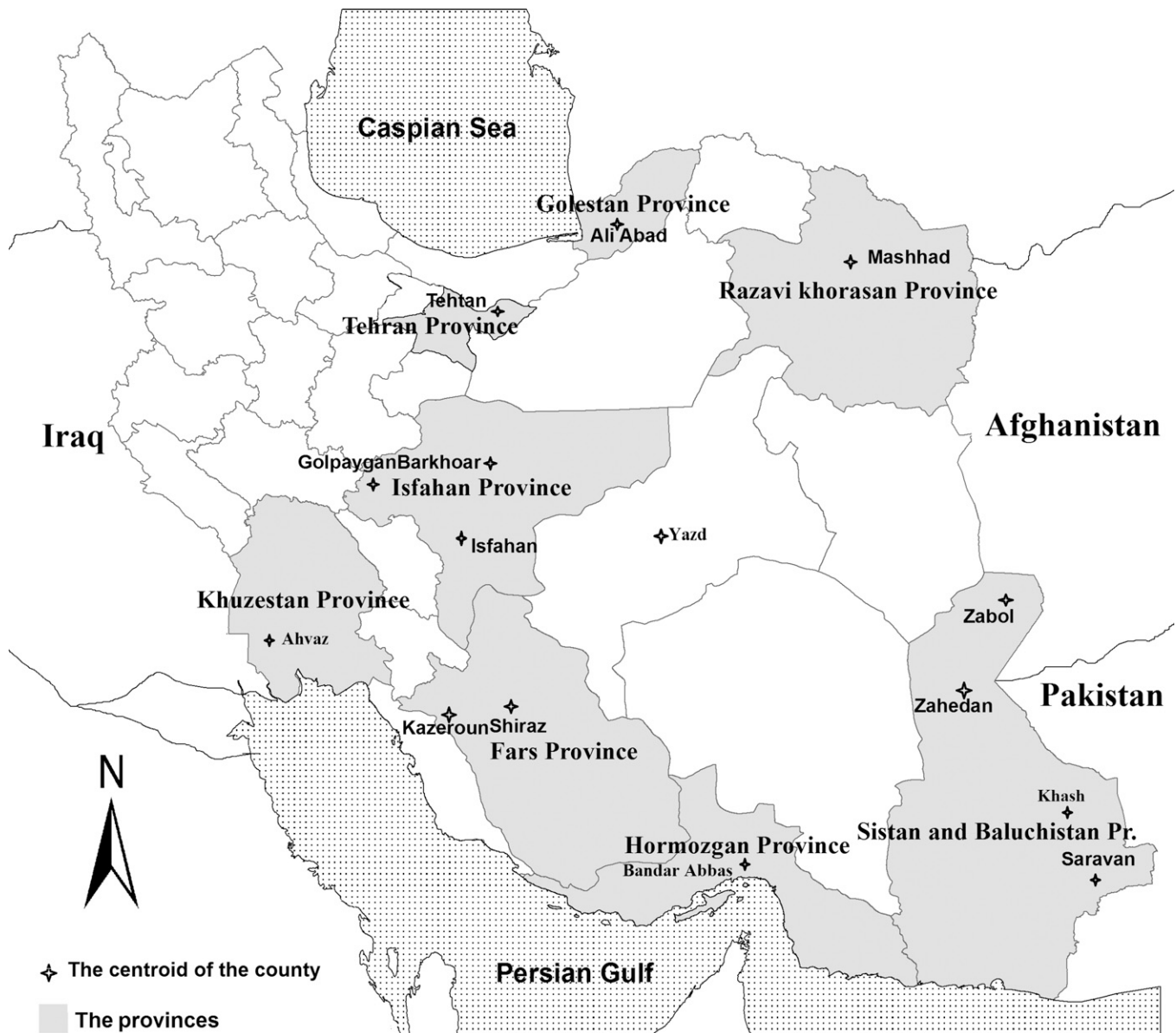
FIGURE 1. Centroids and provinces of Iran.

Arboviruses and Viral Hemorrhagic Fevers of Pasteur Institute of Iran for a 13-year period (1999–2011) (Figure 1). According to the national disease surveillance system, this laboratory is the only diagnostic laboratory for analysis of viral hemorrhagic fevers in Iran. After detecting a probable human case of CCHF, patient serum are maintained in a cold chain and dispatched to this laboratory for confirmation.