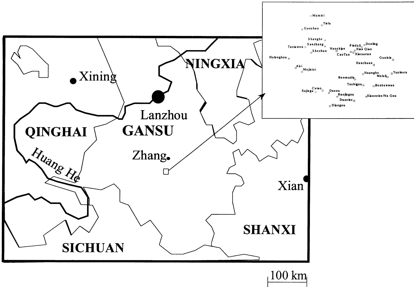
FIGURE 1. Geographic location of the screening area in Gansu Province, China.

stood for the examination. The liver was scanned in axial and longitudinal sections for the left hepatic lobe and in axial, subcostal, and recurrent subcostal sections for the right hepatic lobe. All examinations were performed or supervised (for teaching local doctors) by a single experienced examiner (B.B.). A 5-mL sample of venous blood (in addition to filter paper blood spots) was taken from patients whose ultrasound image suggested AE; from one out of every 5 people (chosen randomly) with isolated punctate calcifications in the liver; and from one out of every 50 people without evidence of liver lesions.