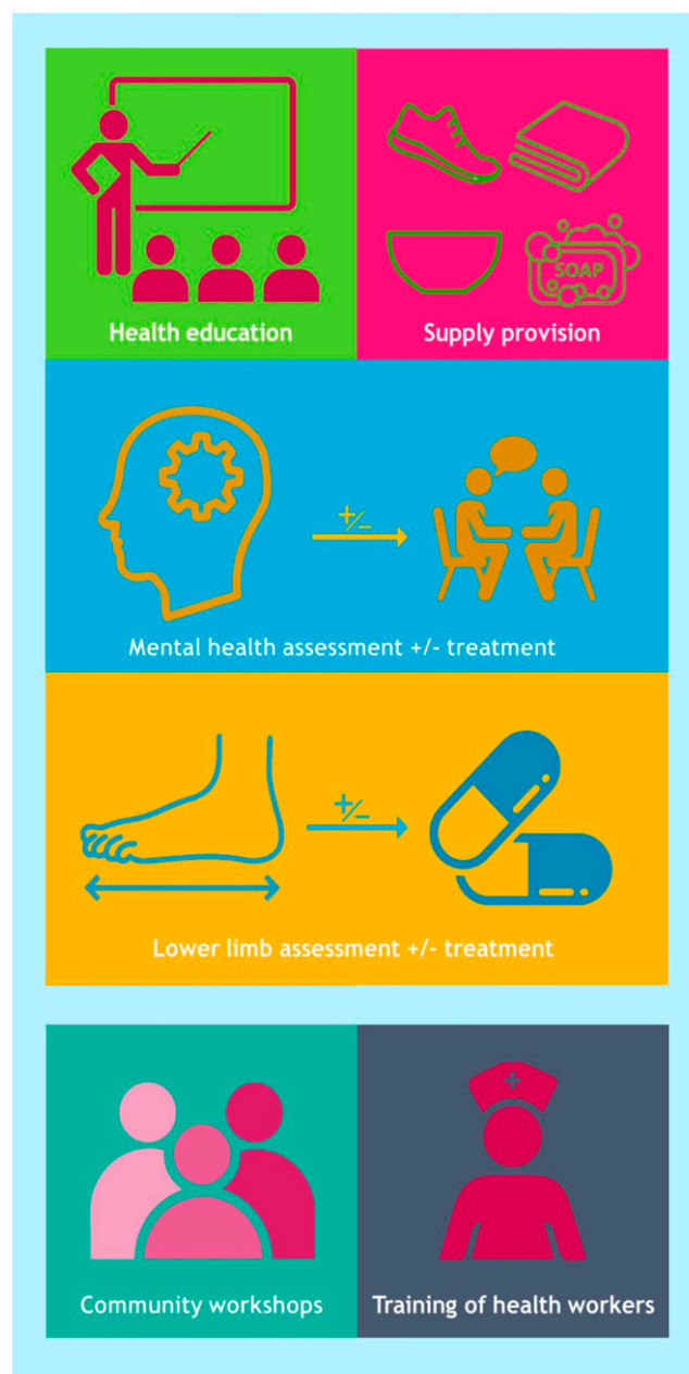
FIGURE 1. Overview of the EnDPoINT care package. For individuals with lymphedema, the package consists of regular health education sessions that focus on encouraging self-care and improving foot hygiene; supply of custom-made shoes and simple equipment for washing; assessment of mental health, and if required, treatment with antidepressants or counseling; assessment of lower limbs, and if required, treatment with antibiotics or appropriate ointment/bandaging. In the wider community, the package involves community workshops for stigma reduction and training of health professionals. This figure appears in color at www.ajtmh.org .

At baseline, healthcare professionals conducted assessments of participants' lower limbs and mental health. If required, acute treatment was arranged. For lower limb