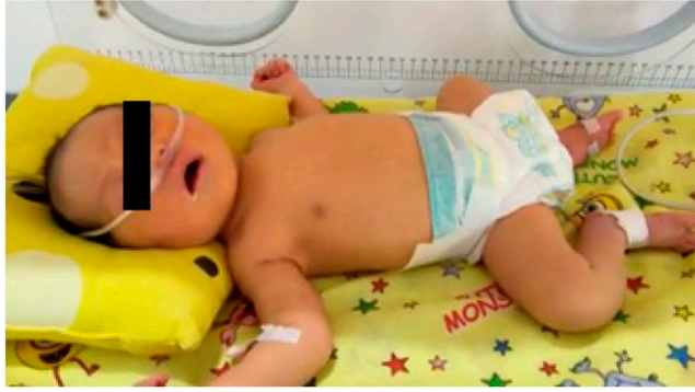
FIGURE 1. Photo of the patient on day 6 of hospitalization (icteric, Kramer III). This figure appears in color at www.ajtmh.org .