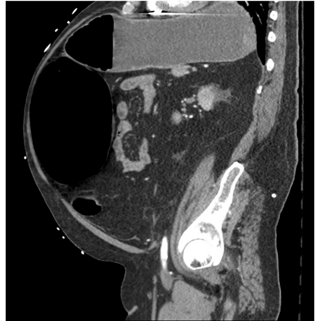
FIGURE 2. Computed tomographic study of the abdomen and pelvis in the sagittal plane revealing distention of the stomach, duodenum, and transverse colon.

SD above the mean for Chagas megacolon) (Figures 1–3). 2 Trypanosoma cruzi IgG was positive by ELISA, and IgM and polymerase chain reaction were negative. The patient reported travel limited to Cuba, France, and the Democratic