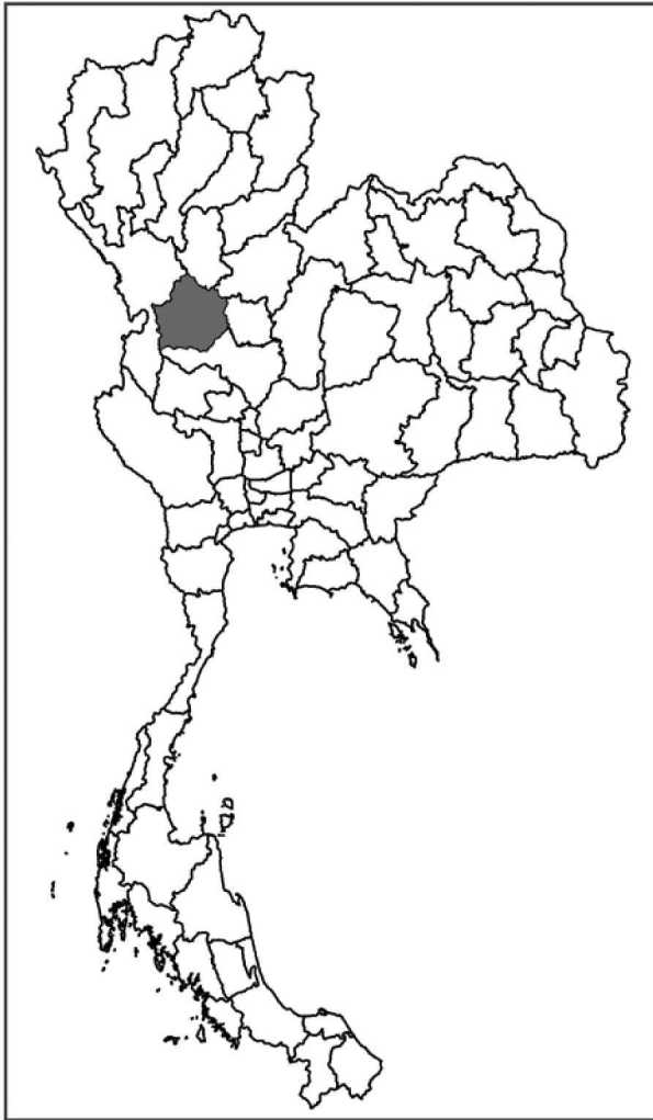
FIGURE 1. Location of Kamphaeng Phe Province (gray area) in Thailand.

all specimens, after depersonalization, were also evaluated for the presence of IgM antibodies using the Leptospira IgM enzyme-linked immunosorbent assay (PanBio Inc., Brisbane, Queensland, Australia) at the Armed Forces Research Institute of Medical Sciences according to the manufacturer's instructions. 18 Sera with a titer > 11 PanBio units was considered positive and 9–11 PanBio units as equivocal. Confirmatory MAT was performed on both S1 and S2 if either was determined to be positive or equivocal. The MAT was performed at the Veterinary Command Food Analysis and Diagnostic Laboratory in Texas using a battery of 24 serovars from 20 serogroups selected specifically for use in Southeast Asia. A reactive antibody titer \geq 1:800 (suggested cut-off for disease-endemic areas) 19 from a single serum sample or a four-fold or greater increase in paired serum samples in clinically compatible cases were classified as confirmed leptospirosis. A clinically compatible case with supportive serologic findings (MAT titer \geq 1:400 in one or more serum specimens) was considered as probable. 20 These probable cases were not included in the statistical analyses.