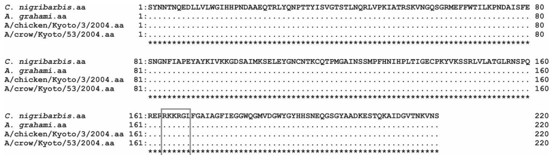
FIGURE 3. Amino acid sequences converted from a partial nucleotide sequence of the HA segments isolated from C. nigribarbis and A. grahami . Sequences of H5N1 influenza viruses isolated from infected chickens (A/chicken/ Kyoto/3/2004) and crows (A/crow/Kyoto/53/2004) derived during this outbreak period in Kyoto were used as references. Enclosed alignments indicate the cleavage site.