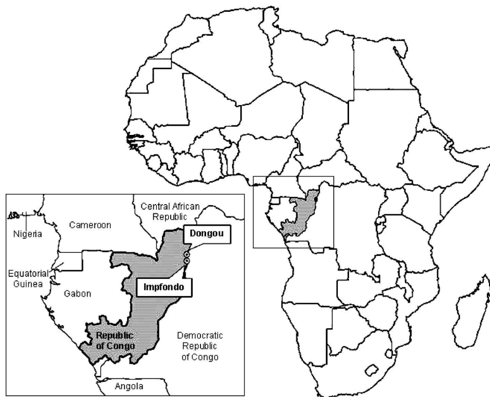
FIGURE 1. Location of human monkeypox cases in the Republic of Congo, 2003.

monkeypox virus DNA signatures were present in the clinical specimens, at which time the Ministry of Health and Population of the Republic of Congo launched an official investigation of the outbreak. Illness onset of the final recorded case in Impfondo occurred on June 23, 2003.