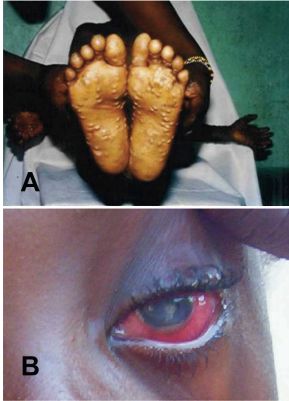
FIGURE 3. A , Child with pustular-stage rash consisting of ~200, 3–5-cm, flaccid, vesicular lesions, all at a similar stage of development, with classic centrifugal distribution (lesions located preferentially on the palms of the hands, the soles of the feet, and on the scalp and face). Fewer lesions were also noted on his neck, trunk, perineum, and all four limbs. B , Child with viral conjunctivitis causing intensely erythematous sclera and corneal opacities obscuring the pupil. This figure appears in color at www.ajtmh.org .

pustular rash. Her cause of death was undetermined since she died with both acute monkeypox infection and a post-operative infection. A second child was observed six weeks post-illness onset with a severe sustained viral conjunctivitis of the left eye, with extensive damage. At evaluation, she was noted to have corneal opacities obscuring her pupil and an erythematous sclera (Figure 3B). Several children retained hypopigmented areas where lesions had occurred up to eight weeks from illness onset. The rash and fever in the infant child abated, but he never regained full health and died approximately six months later, reportedly due to some form of hemolytic anemia.