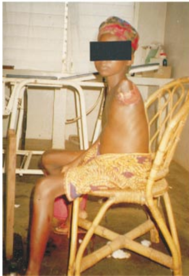
FIGURES 2 and 3. 2 (top) , typical Mycobacterium ulcerans infections with massive destruction of the skin. 3 (bottom) , amputation of the left upper arm as a result of infection with Mycobacterium ulcerans .