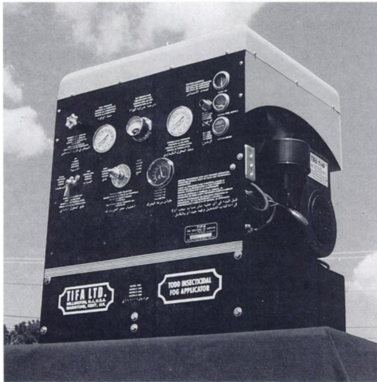
TIFA MODEL 100E FOGGING MACHINE

Tifa regularly provides training programs to the end users of Tifa equipment for the control of vector diseases such as malaria, Rift Valley fever, encephalitis, leishmaniases, Dengue fever and other epidemic diseases which attack animals and humans. There are more than 25,000 Tifa machines in more than 80 countries which are used by Ministries of Health, hospitals and other medical or health facilities. Tifa literature is available in 12 different languages. Contact Tifa for additional information.